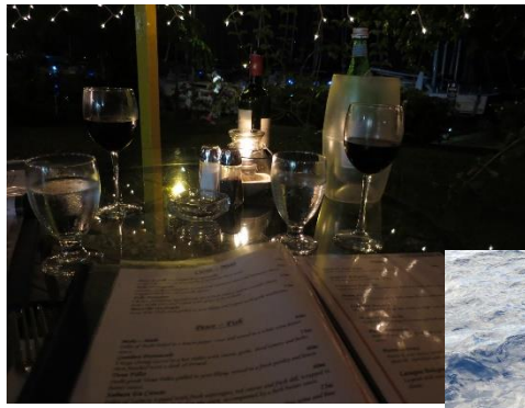
Gather your family and friends, sail away, enjoy and live the cruising life on your very own 50 ft catamaran.

You can sail The Oceans of the world; explore far off places, be with nature, swimming in pristine waters, enjoy tropical Islands, walk on deserted beaches, try local cuisines, see inspiring sights, sail with dolphins, explore fascinating places, take images your friends will be truly enthralled about, move when you want and on <u>your</u> floating home. Yes, you can do all of this and so much more.