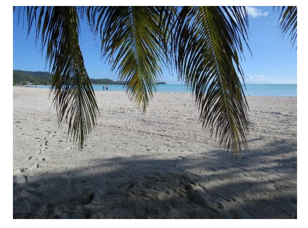
There is a fantastic world out there to enjoy.